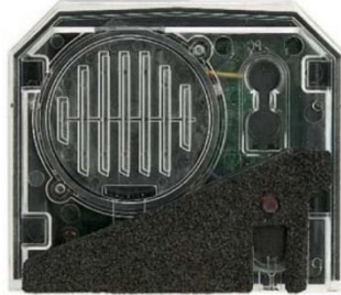
GF-DA and GF-DP

The hint is the the writing or the open space on each panel