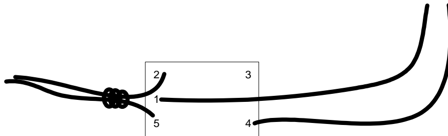
Bottom view of relay within RY-PA after field modification. (Normally Closed)